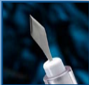
• Phaco Slit